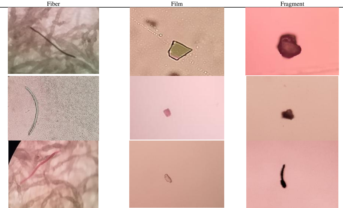
Table 1. Types of microplastics found

Based on Table 1, there are three types of microplastics at stations I, II, and III, namely fiber, film, and fragment-type microplastics found in the digestive tract of water flower fish. Fiber-type microplastics are elongated and thin, like a net/fishing line (Wicaksono, 2018). Film-type microplastics are irregular shapes derived from thin plastic fragments, transparent color, and low density (Ayuningtyas et al., 2019). Fragment-type microplastics come from pieces with a shape that tends to be irregular with sharp edges (Dai et al., 2018). Film and fragment-type microplastics in the study were sourced from plastic waste such as plastic bags or containers. Fiber-type microplastics can be sourced from fishing activities by fishermen/communities using nets/ rods that allow fiber degradation in fishing gear.