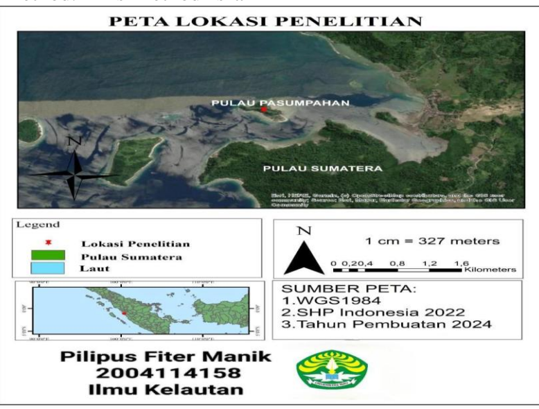
Figure 1. Research location

modification of the Belt Transect method combined with the Reef Check Bentos method. Transect lengths on coral reefs were synchronized using the Benthos Belt Transect method to see the relationship between megabenthos abundance and coral reef cover.